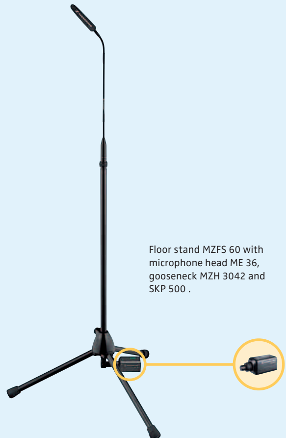
Floor stand MZFS 60 with microphone head ME 36, gooseneck MZH 3042 and SKP 500 .