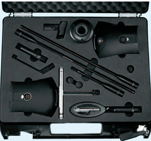
Installed Sound Base Kit XLR-3