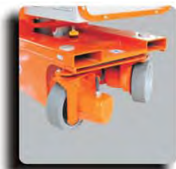
Tight Turning Radius