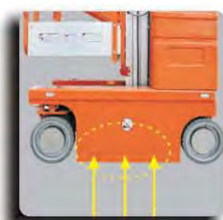
Automatic Pothole Protection