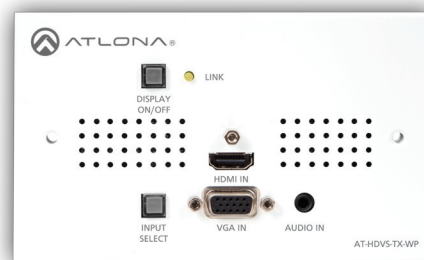
AT-HDVS-TX-WP (UK Version)